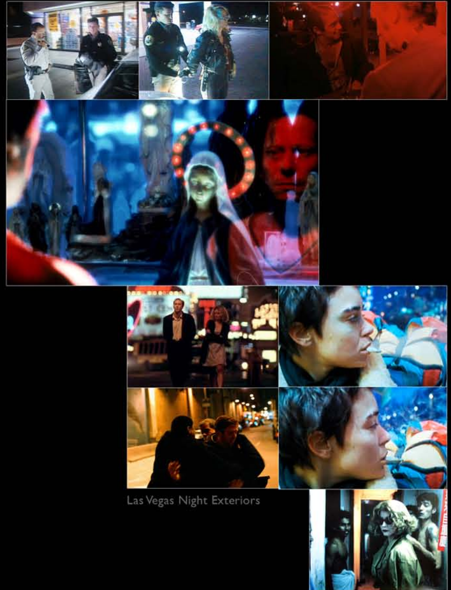
Las Vegas Night Exteriors