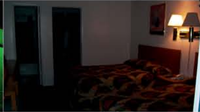
Boulder Highway Motel