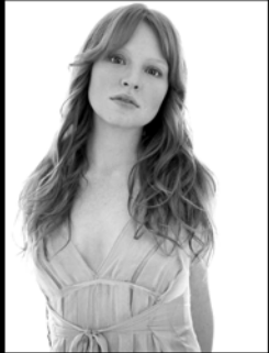
ANGELA - LAUREN AMBROSE

(film: WHERE THE WILD THINGS ARE, LOVE AND OTHER IMPOSSIBLE PURSUITS, A DOG YEAR, STARTING OUT IN THE EVENING, COLD SOULS, DIGGERS, theater: ROMEO & JULIET, EXIT THE KING, AWAKE AND SING!, BURIED CHILD, tv: HBO series SIX FEET UNDER as Claire Fisher, received two Emmy nominations for Outstanding Supporting Actress in a Drama Series)