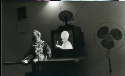
Angela's daughter Sunny